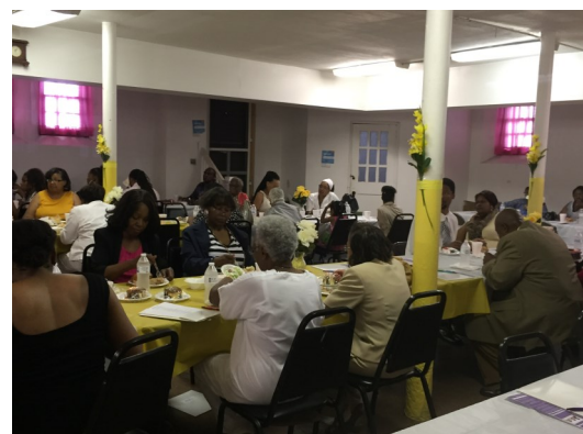
Akron Community Forum attendees.