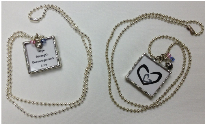
Each necklace contains both the front and back sides as shown