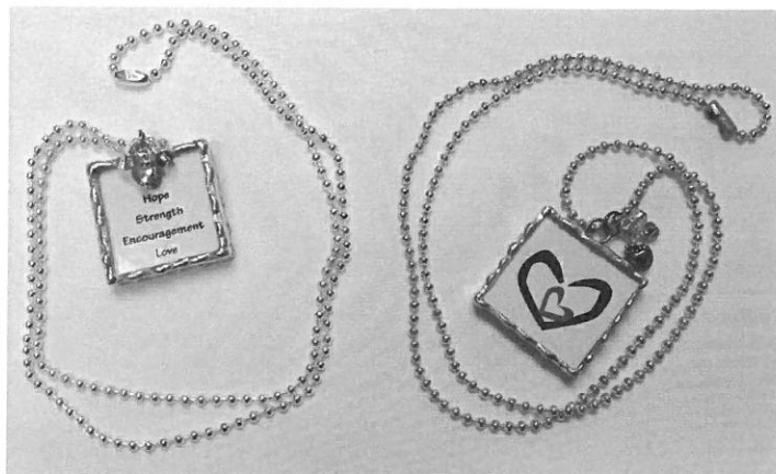
Each necklace contains both the front and back sides as shown